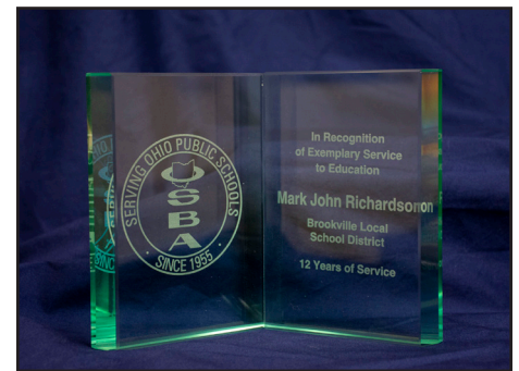
I. Jade crystal book — $75 7.875" x 5.875" x 0.75" jade crystal book with two locations for etching. Book weighs four pounds.