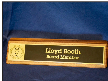
H. Desk nameplate — $45 10.5" x 3" walnut wedge with personalized black steel plate with gold lasered lettering. Plate size: 10" x 1.75"