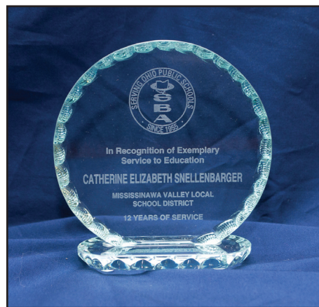
K. Round crystal plaque — $55 5" tall etched beveled-edge jade crystal plaque with glass base. Base: 4" x 2.5"