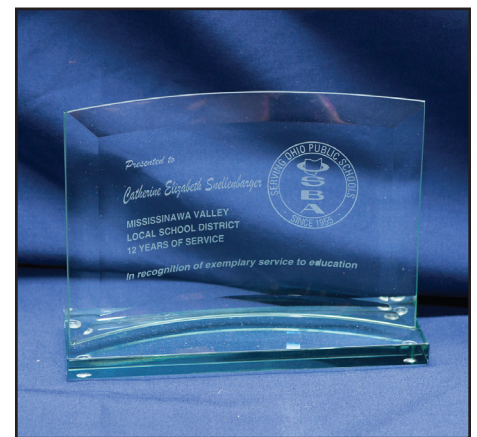
L. Curved glass plaque — $60 4.5" tall bevel-etched glass plaque with a glass base. Base: 6" x 2"