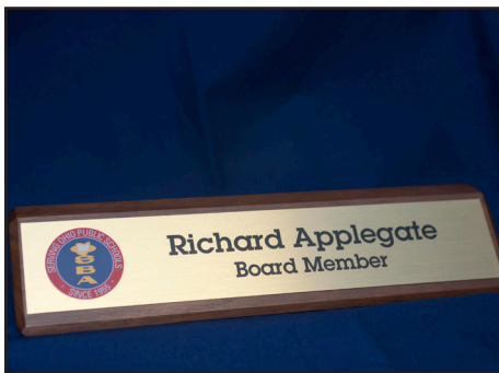
G. Color desk nameplate — $42 10.5" x 3" walnut wedge with personalized etched plate. Plate size: 10" x 1.75"