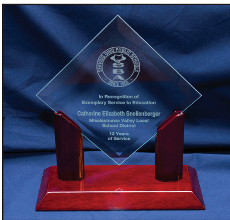
J. Jade crystal plaque — $48 9" tall etched jade crystal plaque on piano wood base. Base: 9" x 4"