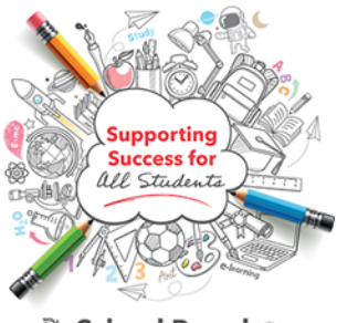
School Board Recognition Month JANUARY 2023