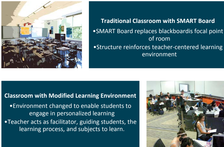
Figure 1.6: Differences in Adapting Learning Environments to Technology

personalized learning classrooms should be structured differently than traditional classrooms in order to better reflect the new roles of teachers and curricula in personalized learning environments. Below, Figure 1.6 compares and contrasts the traditional classroom structure with a modified classroom structured around personalized learning.