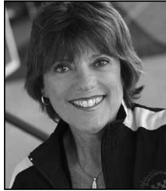
Lyn St. James