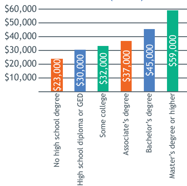
Median annual earnings for young adults ages 25-34 based on education (2011)