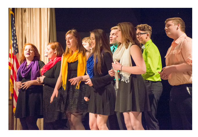
North Union High School's NU Age a cappella

The region's only 2015 Blue Ribbon School recipient was honored. The Blue Ribbon Schools Program is a national recognition program, honoring elementary and secondary schools in the United States that make significant progress in closing achievement gaps or whose students achieve at the highest levels in their state. We were pleased to award the outstanding school blue ribbon award to the board, administration and staff of Hamilton Local's Hamilton Township High School.