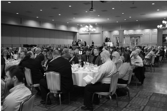
Full house at the 2019 Spring Conference