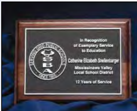
A. Horizontal plaque — $75 8" x 6" walnut plaque with etched plate. Plate size: 6.5" x 4.5"

Available in a variety of styles and sizes, these popular plaques and awards arrive ready for presentation.