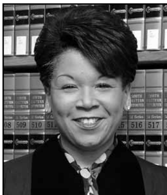
Yvette McGee Brown

As lead juvenile court judge, she led the creation of the Family Drug Court and the