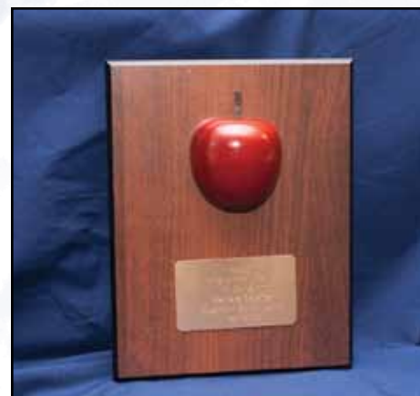
L. Apple plaque — $55 7" x 9" x 2" walnut plaque with three-dimensional red wooden apple and inscribed plate. Plate size: 4" x 3"

Order now from OSBA's variety of high-quality styles and designs. Place your order by faxing the form on the back of this brochure to (614) 540-3299 or visit www.ohioschoolboards.org/catalog and place your order online. Please allow two to four weeks for delivery of customized awards. For quick orders, try OSBA's State of Ohio plaque, which will arrive in 10 days or less.