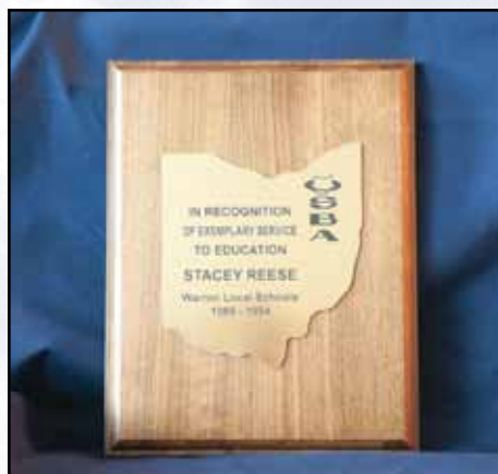
K. State of Ohio plaque — $50 7" x 9" mahogany plaque with inscribed gold metal plate. Plate size: 4.5" x 5"