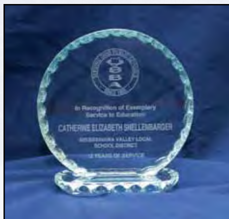
H. Round beveled-edge jade crystal plaque — $50 5" tall etched glass plaque with glass base. Base: 4" x 2.5"