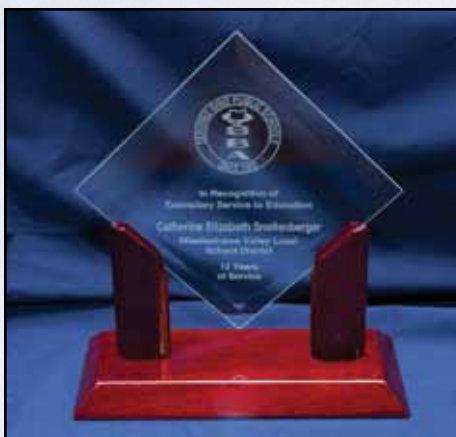
G. Triangle jade crystal plaque on rosewood base — $60 9" tall etched glass plaque on rosewood base. Base: 9" x 4"