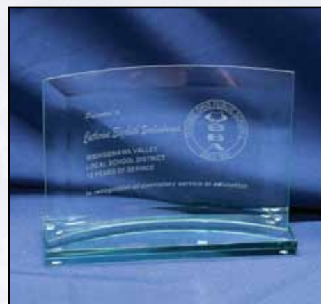
I. Curved glass plaque — $45 4.5" tall bevel-etched glass plaque with a glass base. Base: 6" x 2"