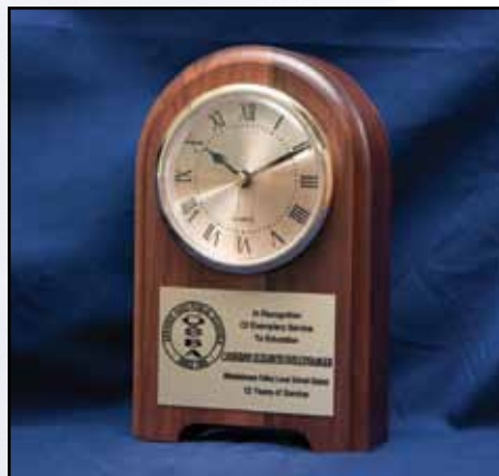
E. Round-top desk clock — $65 4.75" x 7.5" walnut base with 3" diameter battery-operated clock with inscribed plate. Plate size: 3.5" x 2.25"