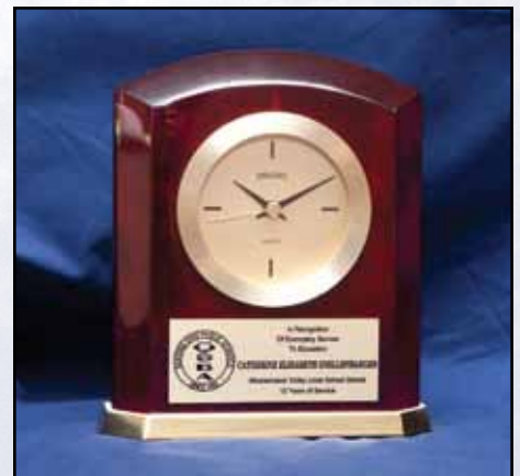
F. Rectangle rosewood desk clock — $70 5.75" x 6.75" brass base with 2.625" diameter battery-operated clock with inscribed plate. Plate size: 3.75" x 1.5"