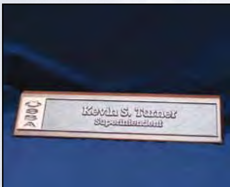
D. Desk nameplate — $65 10.5" x 3" walnut wedge with personalized etched plate. Plate size: 10" x 1.75"