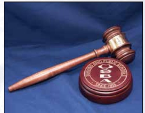
C. Gavel and block — $50 10" gavel and 4.25" walnut block with inscribed plate. Plate size: 4.5" x .875"