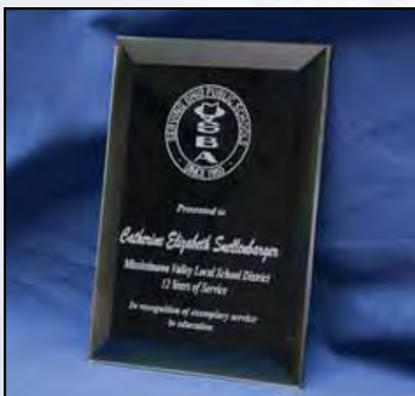
J. Black glass plaque — $50 5" x 7" bevel-etched black glass plaque.