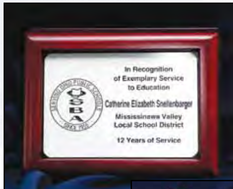
B. Walnut box — $80 7.25" x 5.5" x 3" walnut box with etched plate. Plate size: 4" x 3"