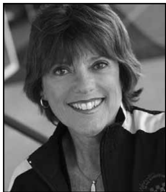
Lyn St. James

Lyn St. James' story is remarkable, culminating in victories few others can claim — winning the title of Indianapolis 500 Rookie of the Year and setting 31 international and national closed circuit speed records. Sports Illustrated for Women selected her as one of the Top-100 Women Athletes of the Century.