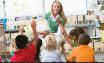
Education for all