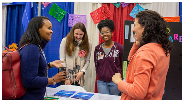
Reynoldsburg City's The Beautiful Culture Project participated in the 2022 Student Achievement Fair.

The Student Achievement Fair is one of the most rewarding exhibitions at the Capital Conference. The event showcases many innovative programs districts have created to boost student achievement and engage students in their learning. The exhibition offers excellent opportunities to learn about new programs, share ideas and celebrate what Ohio's public education is all about — helping students achieve.