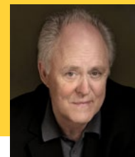
Actor and author John Lithgow