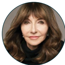
MARY STEENBURGEN Second General Session