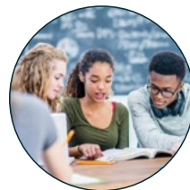
STUDENT PERSPECTIVES OSBA Black Caucus Dinner