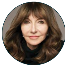
MARY STEENBURGEN Second General Session