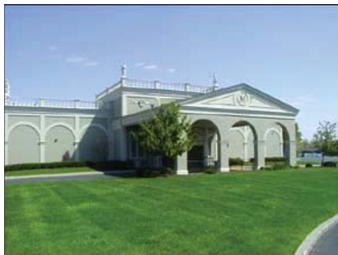
Villa Milano is located at 1630 Schrock Road in northern Columbus. It is easily accessible from I-270 or I-71. For more information visit their website: www.villamilano.com

The Central Region Fall Conference will be held at Villa Milano, in northern Columbus. An excellent program has been designed to provide you with a valuable evening while respecting your time. Villa Milano is famous for their Italian cuisine. We'll be having their house speciality, Pollo Milano (a chicken dish). The meal will give you time to socialize with your own board and/or meet board members from other districts.